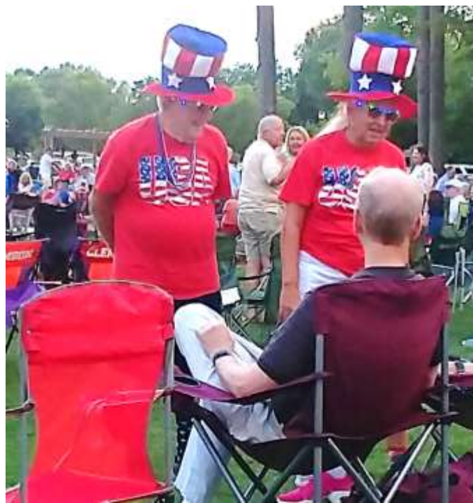
July 2 nd – Independence Day weekend brings out a group of beach music lovers. They moved through the crowd saying 'hello' to some in the audience.