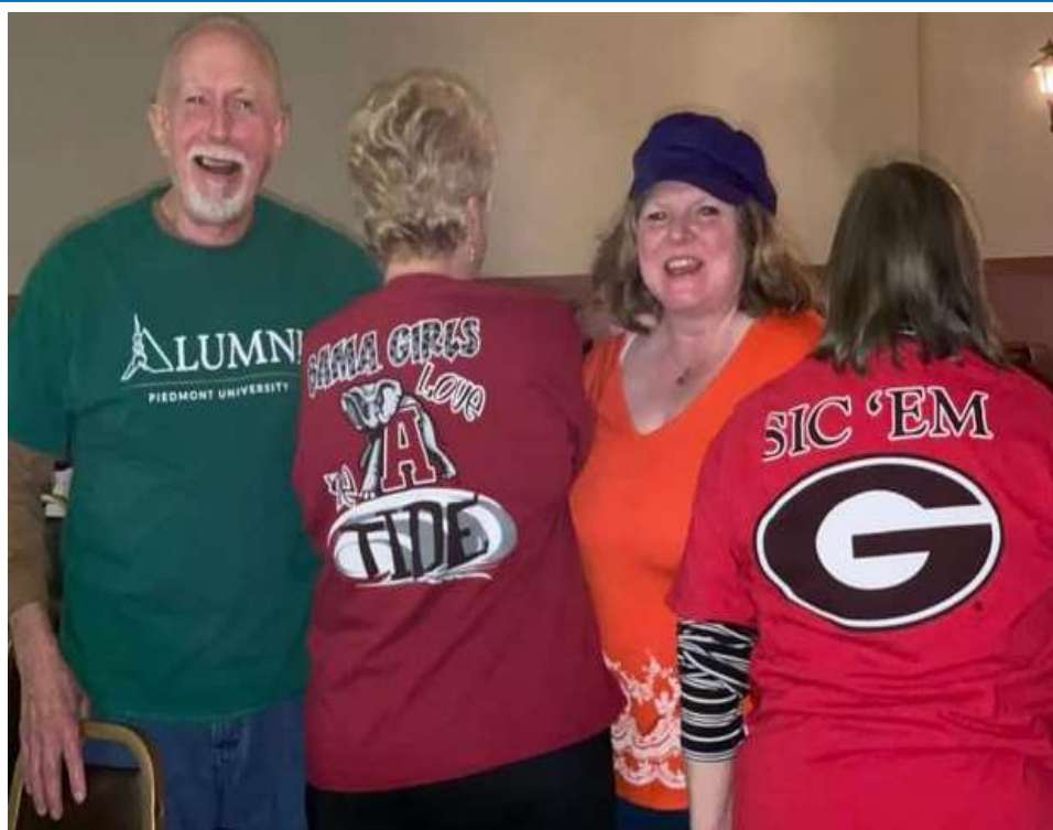
Pictured left-some CSC members show their school colors at R&B Shag Club's monthly dance at the Shrine Club on Fernwood-Glendale Avenue in Spartanburg.