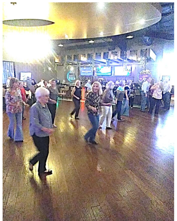
Norman's music brought out a slew of line dancers later in the afternoon.