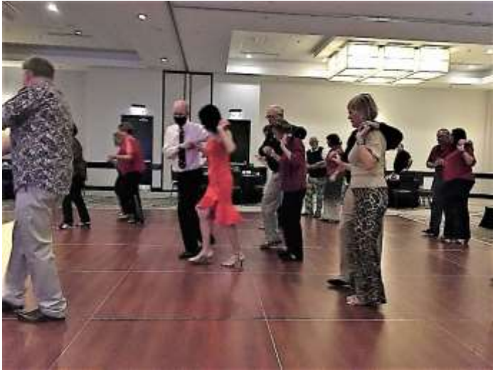
Photo highlights of CSC members enjoying the Christmas Party on December 12, 2020