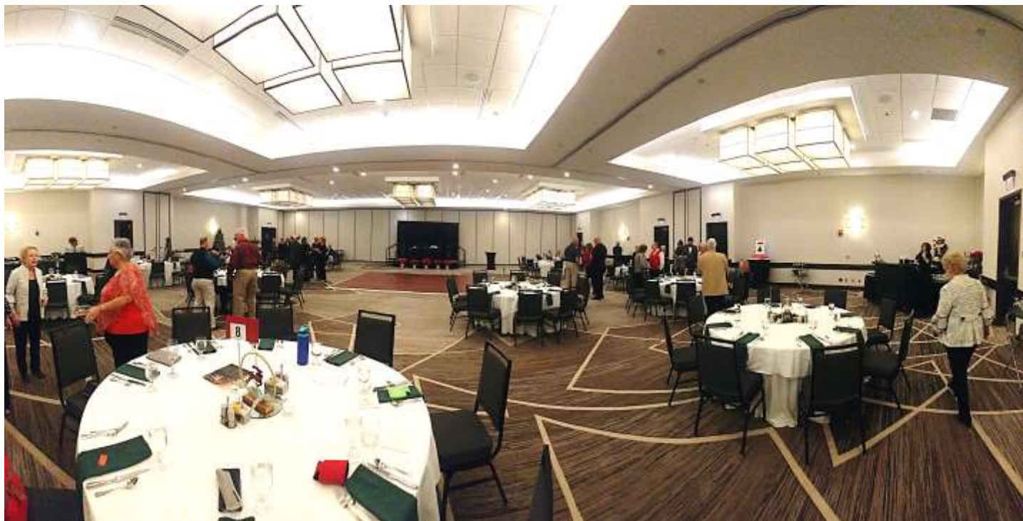
December 4 th – It's early in the evening and CSC members and guests begin to enter the ballroom at Embassy Suites for the Carolina Shag Club Christmas Party.