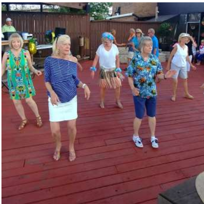
The DJs take a break from shag music to let the dancers enjoy a Tush-Push line dance.