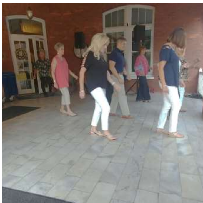
The Belmont Inn in Abbeville, S.C. offered plenty of room for dancing on the porch on June 13 th . Plenty of social distancing seating was available outside.