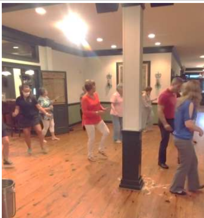
Line dancing is popular at Bermuda's at Stoney Point Golf Course in Greenwood. The venue has an excellent wood dance floor and plenty of space for everyone to relax.