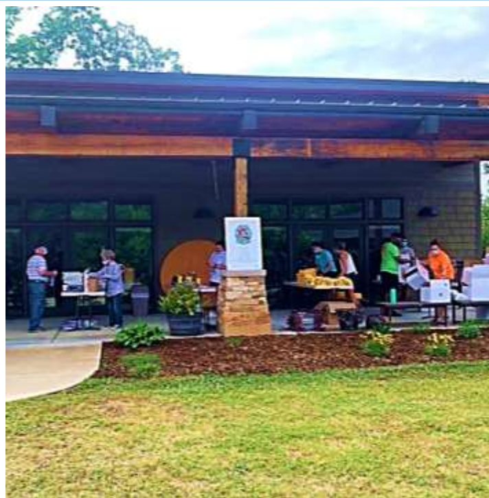
Volunteers work outside in the heat, fighting insects while preparing the camper packages.