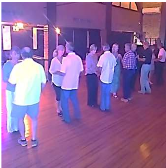
October 9 th - Carolina Shag Club members have been generous in offering free beginner shag lessons or free line dance lessons nearly every Wednesday night. Shag and line dance are offered on an alternating basis.