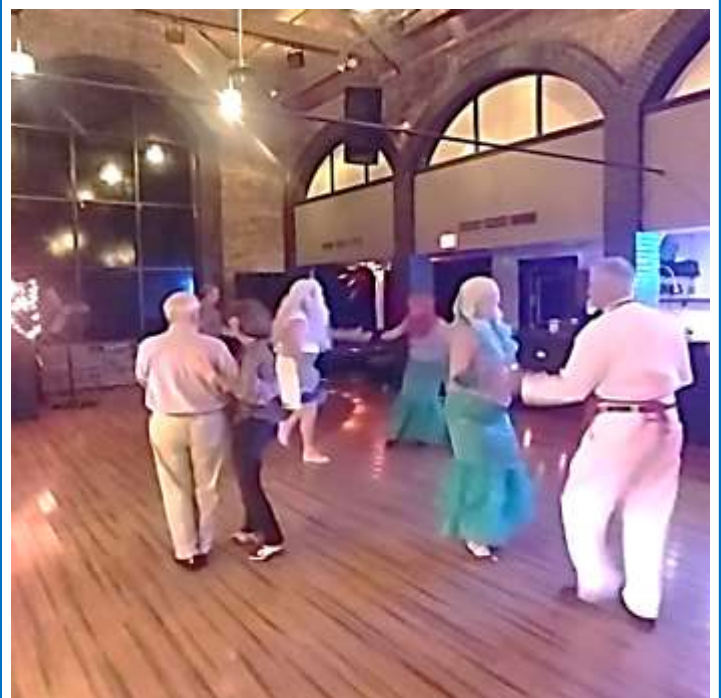
October 27 th - Halloween party goes have a few dances before the “Best Costume” contests begins.