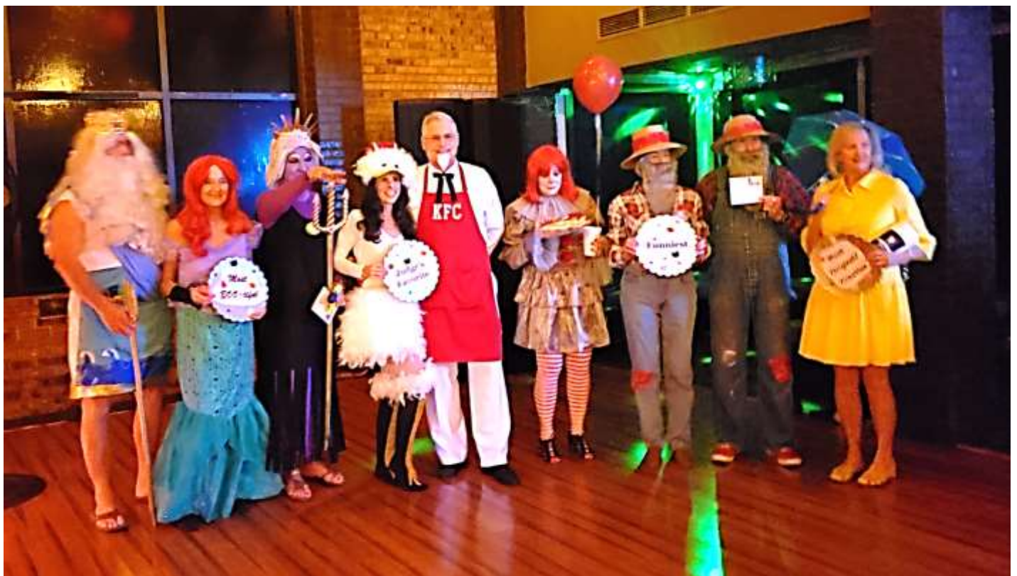
A group photo of all the category winners. Each category won a cash prize.