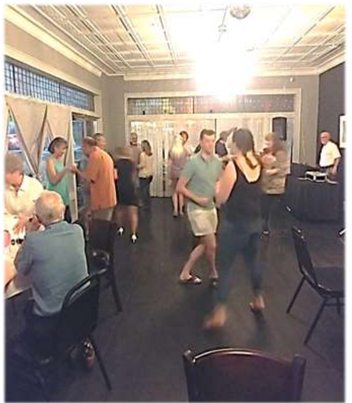
The crowd hits the dance floor later in the evening after many of them dined on Unterhausen's German foods. Numerous German beers were also consumed.