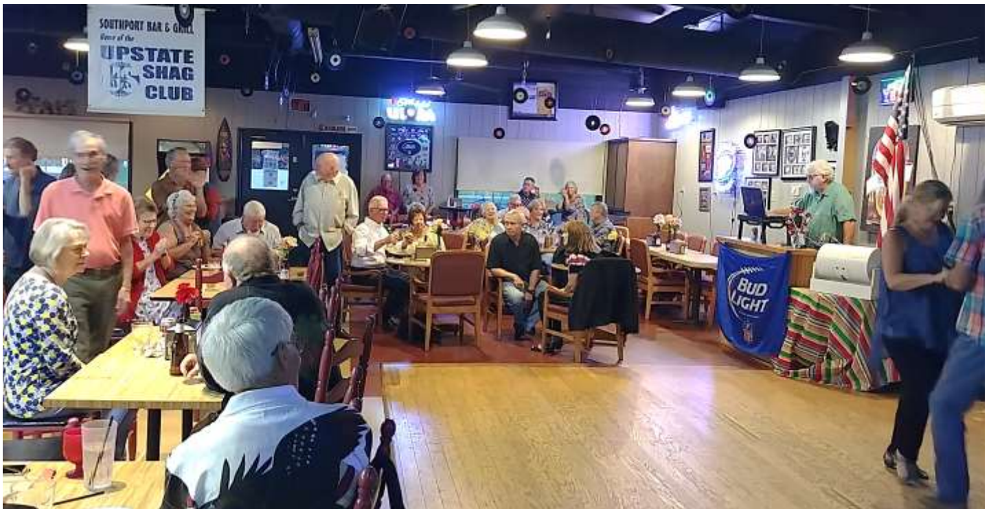
September 11 – Upstate Shag Club dances on the 1 st & 2 nd Saturday of each month at Southport Bar & Grill in Roebuck, S.C. Several CSC members often make the trip to enjoy the music, great bar food and adult beverages. Southport also features a nice, wood dance floor.