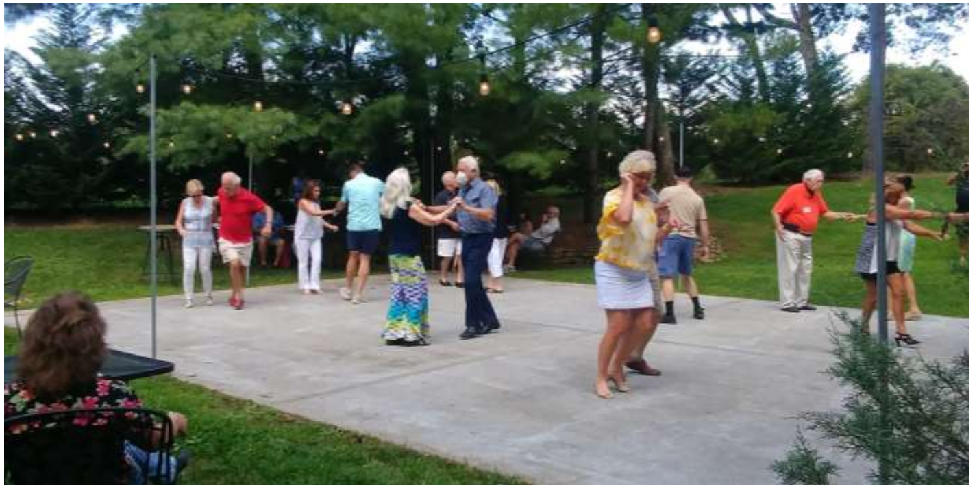
Dancers from the Carolinas and Tennessee enjoy the pleasant afternoon. Several members of Carolina Shag Club came out for the dance.