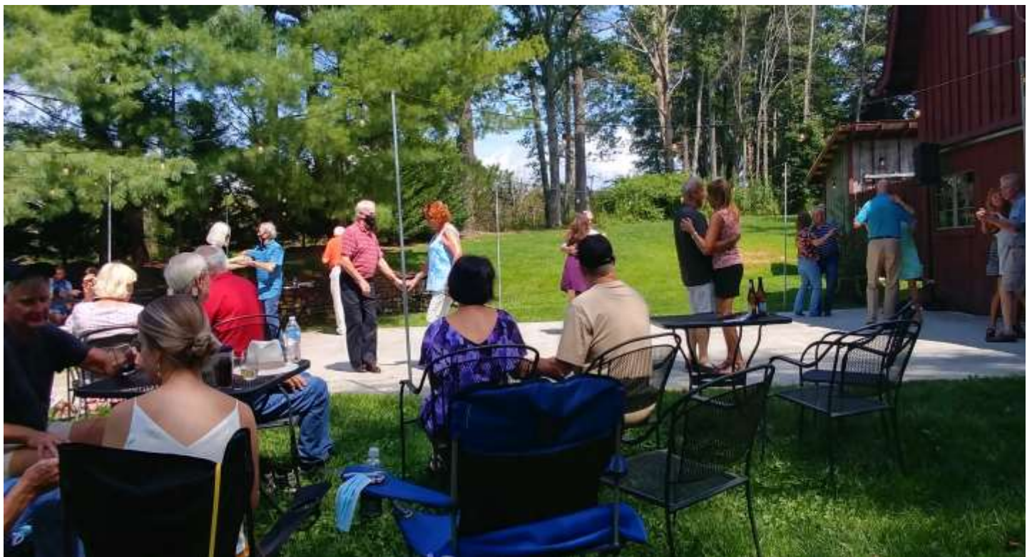
Plenty of lawn seating was available throughout the afternoon. The trees provided plenty of shade from the sun.