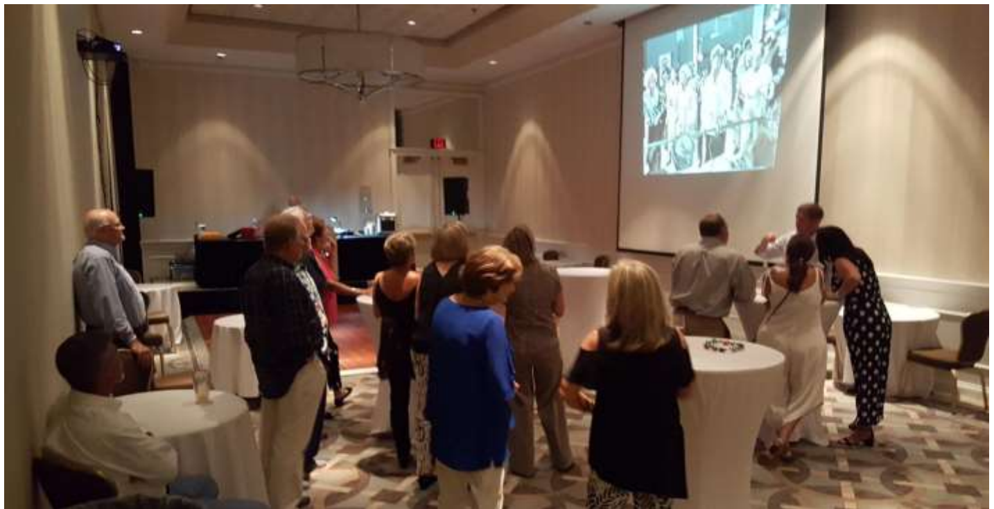
Attendees at CSC’s annual “Meet Me In The Middle” party gather in small groups to enjoy the evening. Party goers are seen in the vinyl room watching some old films of years gone past, often catching a glimpse of a ‘Shadow Shagger’ or old friend in the video.