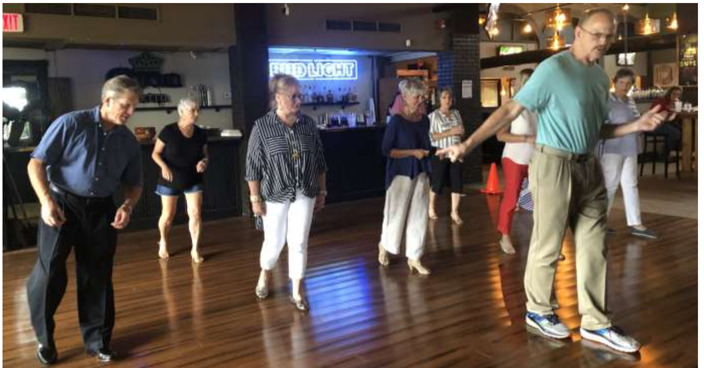
More practice is the best way to learn a new step.