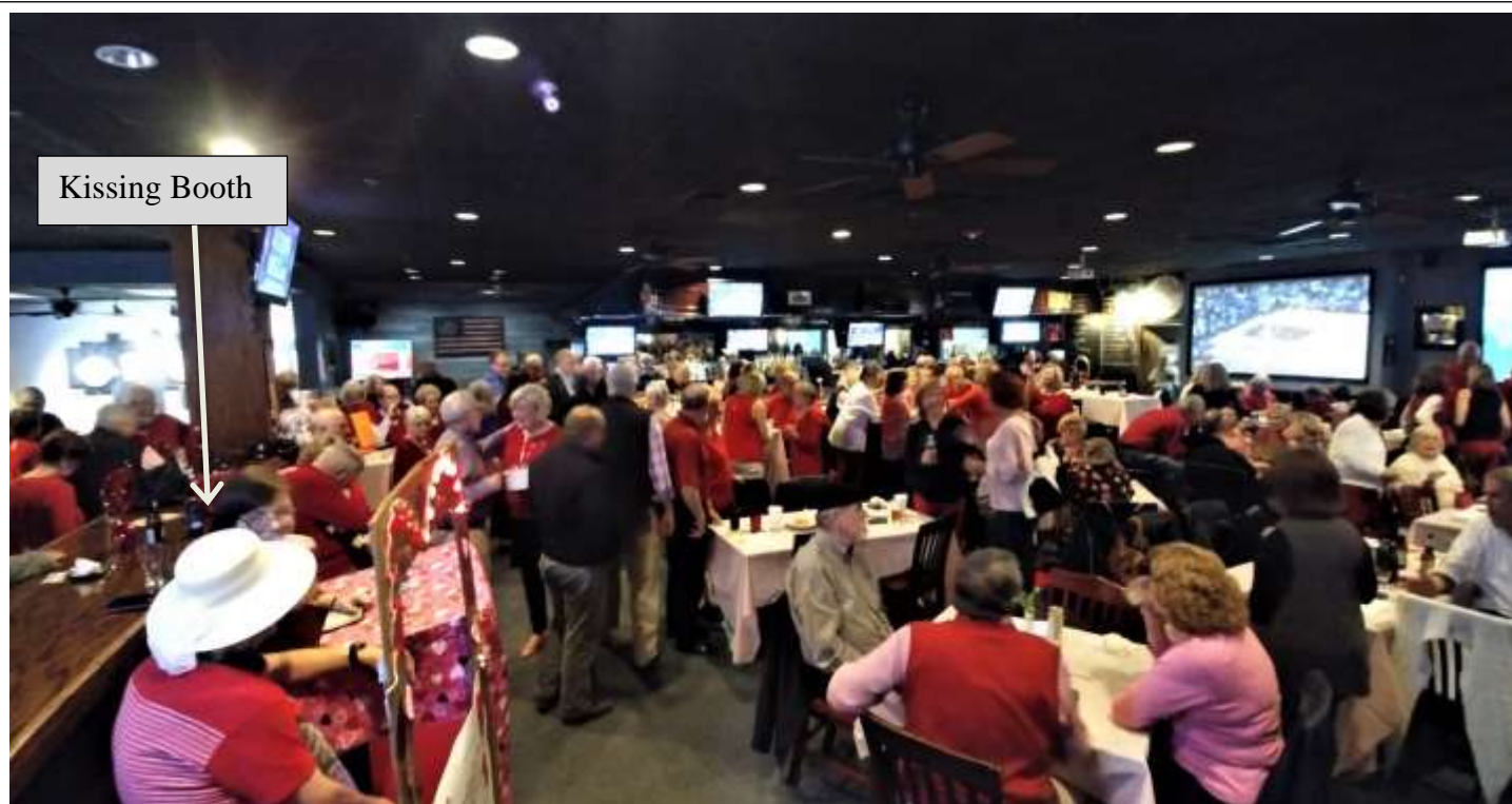
The shag crowd has filled Friar's Tavern for the Valentine's Day party. The party featured a kissing booth containing a fuzzy faced man, free food for members and a raffle of two Valentine's gift baskets